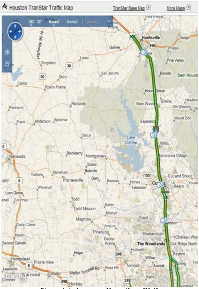
Bluetooth deployment to Huntsville on IH-45